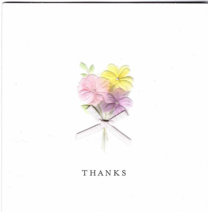
Front of the Card